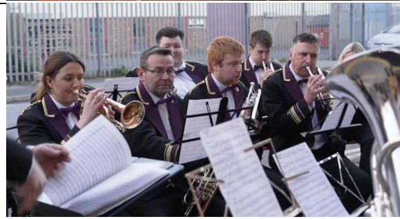
There will also be a band on the third day.